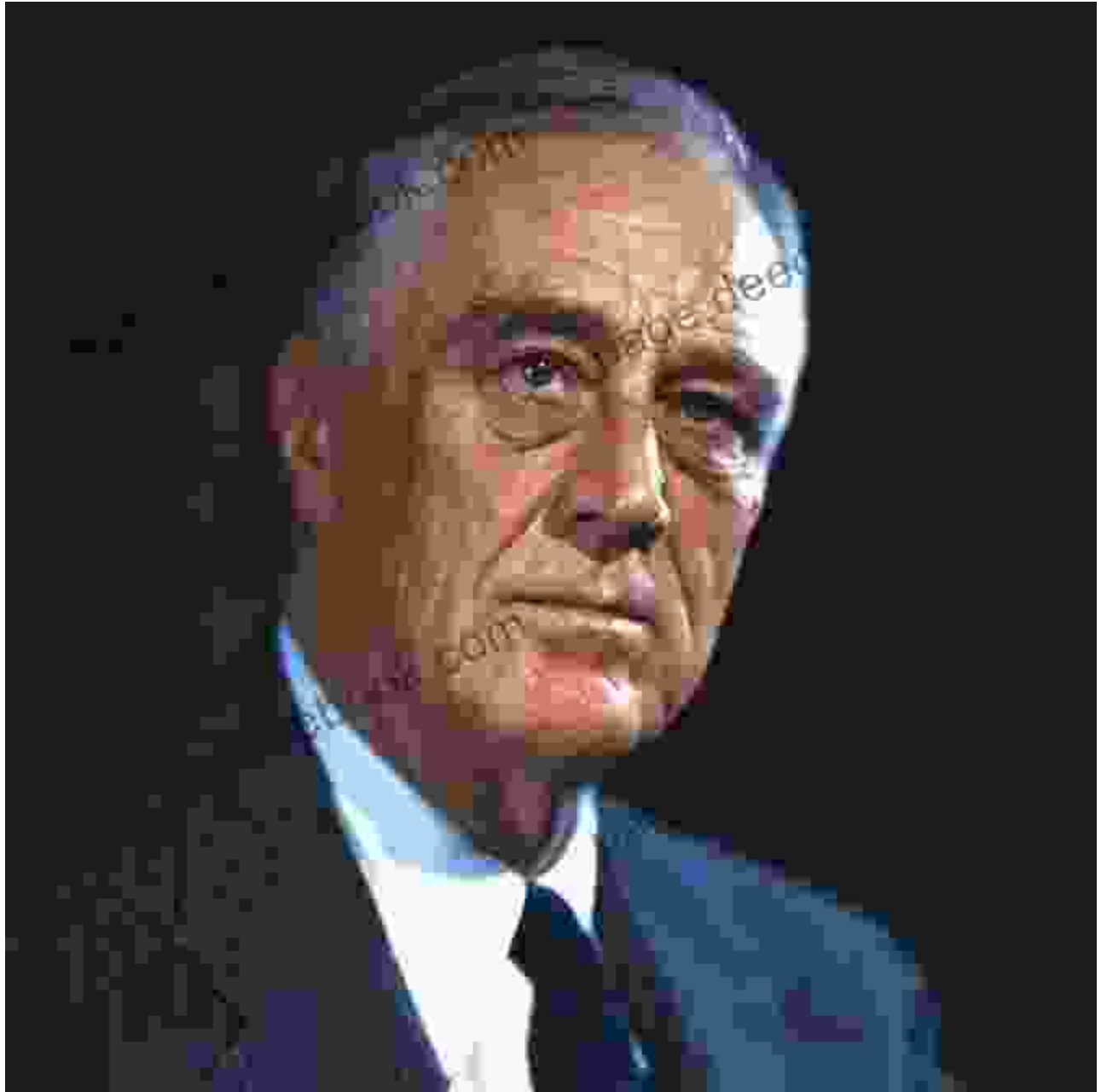
Franklin D. Roosevelt