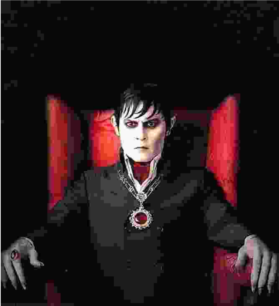
Jonathan Frid's Iconic Performance

In the show's mythology, Barnabas was originally a wealthy 18th-century gentleman who was turned into a vampire by his vengeful mistress, Angelique Bouchard. Cursed to wander the earth for eternity, Barnabas was tormented by the memories of his lost love, Josette DuPres.