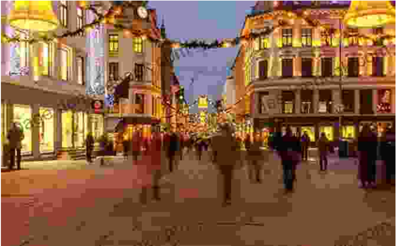
The Oslo Christmas Market in Oslo, Norway

The Oslo Christmas Market is one of the most popular Christmas markets in Europe. It's held in the city center, and it features over 100 stalls selling a variety of Christmas goods, including traditional Norwegian crafts, food, and drinks. The market is a great place to get into the Christmas spirit and find unique gifts for your loved ones.